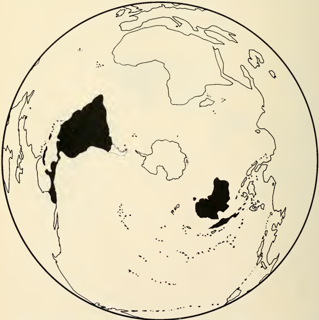
Fig. 10. Distribution of the living members of the family Hylidae (except Holarctic members of the genus Hyla , sensu lato ).

Centrolenidae. This small family of arboreal frogs, which we